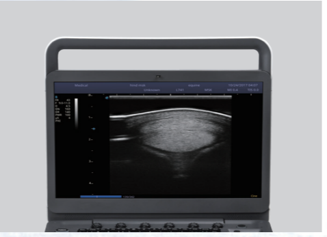
15.6-inch HD monitor