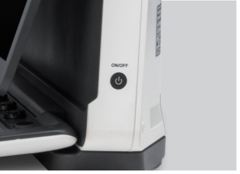
Quick boot-up time