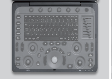
Water-proof protective film