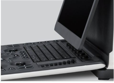
Inclinable monitor and intuitive panel